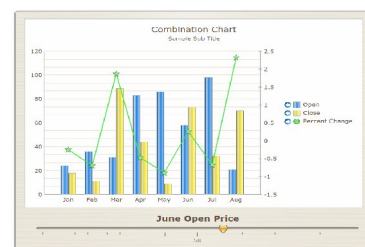
Figure 4: Dual Y-Axis Option