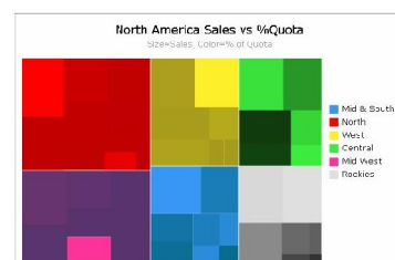
Figure 2: Tree Map Chart