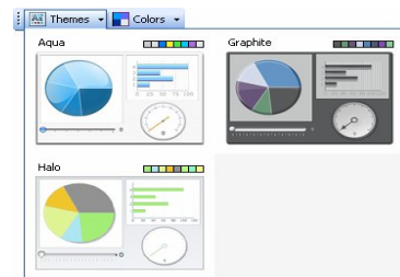
Figure 6: New Themes