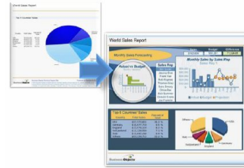
Figure 5: Embed Xcelsius Analytics in Crystal Reports 2008